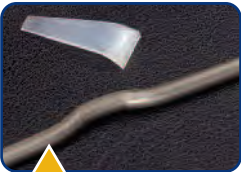
Flag and crimped rod.